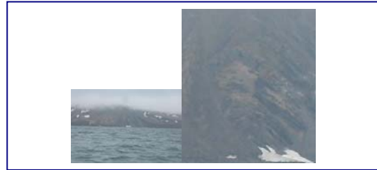
during halibut fishing in May 2008.

Since forming the NIC, and with the teleconference every Friday. NIC meets and discusses what needs to be taken care of, what each village is doing, and what steps are taken care of for individual problems. One of the successes that NIC created was passing an ordinance for all NIC regions. The banning of Styrofoam cups, and bowls used by school district. The NIC had two elders present for each NIC villages during the conference held in